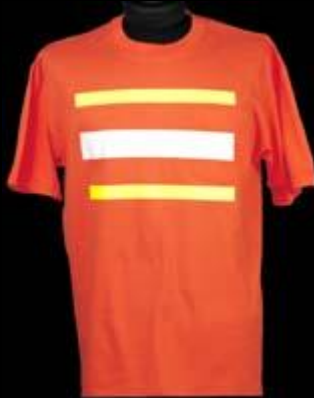
T-Shirts & Sweatshirts

Affordably priced, high-quality 64% poly / 35% cotton Tee. Comfortable, generous cut.